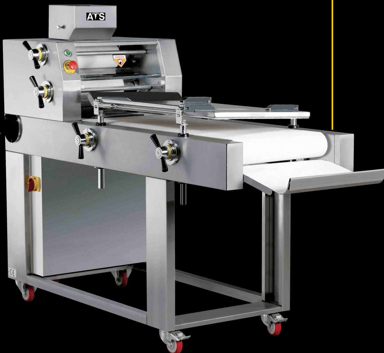
LM 3000 M - SP